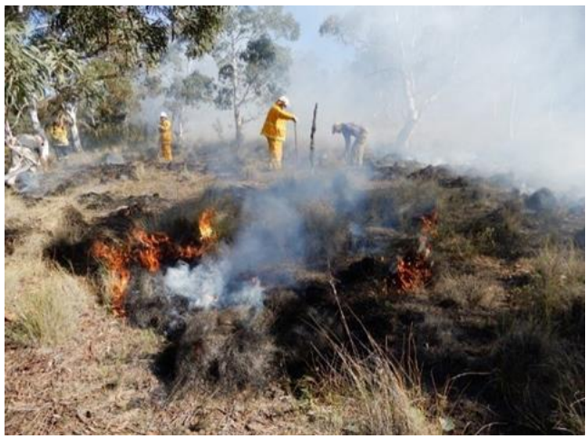
Upper Shoalhaven Landcare's Healing Country and Community with Good Fire Practices

Read these inspiring stories on how our communities are taking action now: <a href="https://bit.ly/3eZnSys">https://bit.ly/3eZnSys</a>