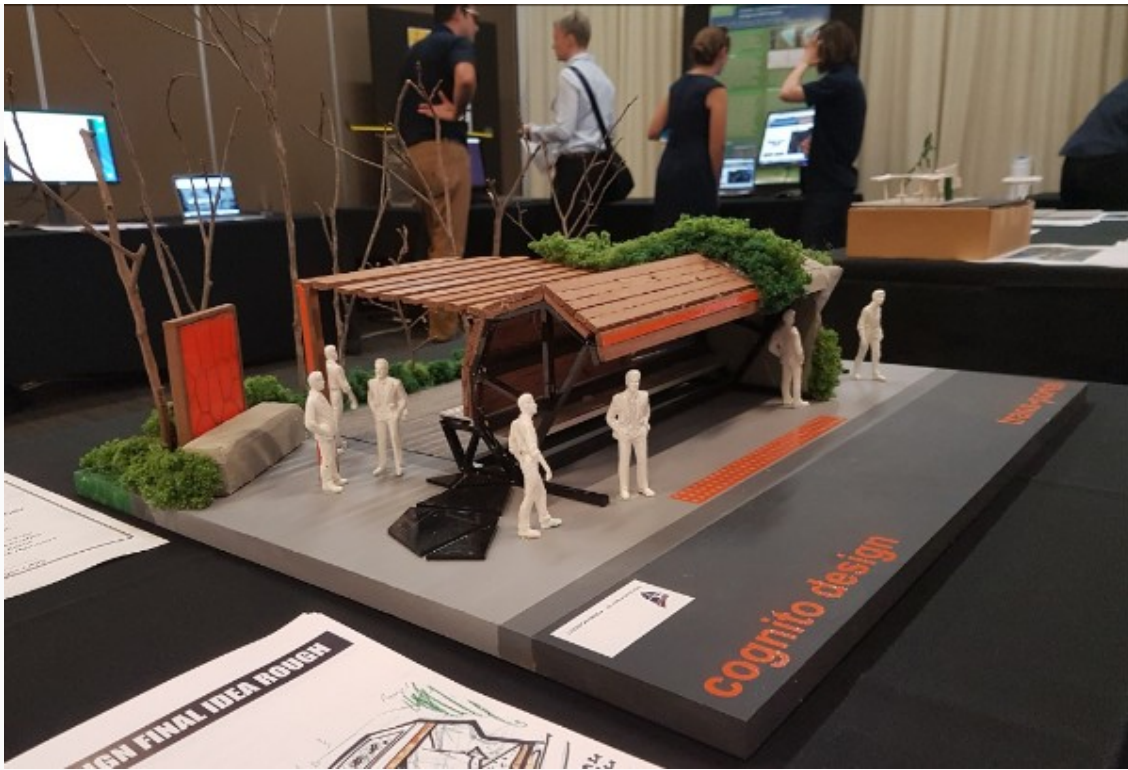
The Climate Adapted People Shelters design competition finalists were on display – examples of how to design bus shelters to be climate friendly spaces.