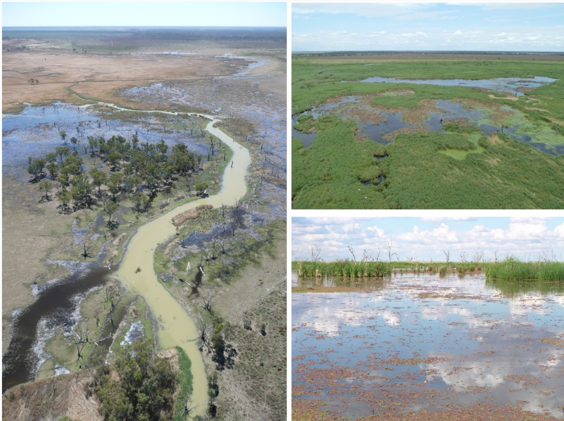
Floodplain wetlands comprised of Phragmites reed beds, water couch grassland and river red gum forest in the northern Macquarie Marshes.

Further information on the grants is available on the Local Government NSW website .